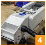
4 Easily removable tape head