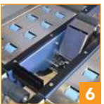
6 Double wipe-down of tape legs and center seam