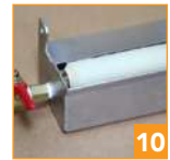
10 Adhesive activation with patented roller technology