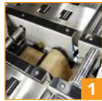
1 Easy tape threading