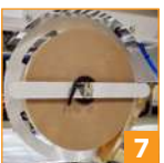
7 Easy tape roll replacement