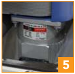
5 Powerful twin 1/3 HP gear motors