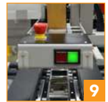
9 Color coded indicator assures proper spacing between cases