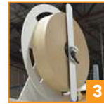
3 Large tape rolls up to 4,500'