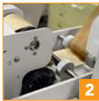
2 Powered tape unwind