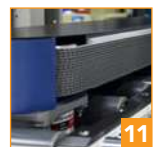
11 Premium side belt drive